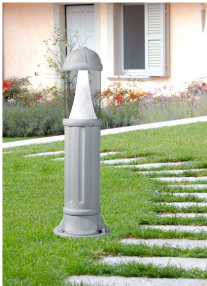
IL 101008 D15.554