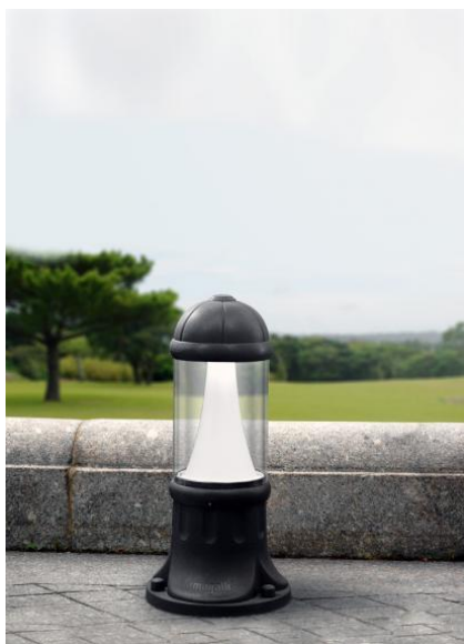
IL 101009 D15.553