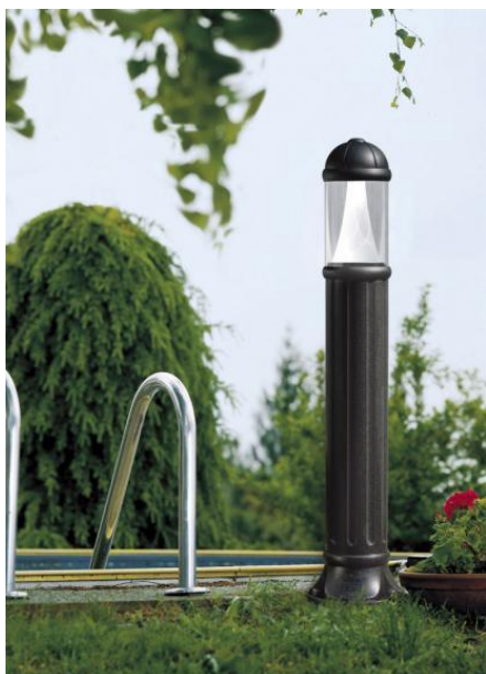
IL 101007 D15.555