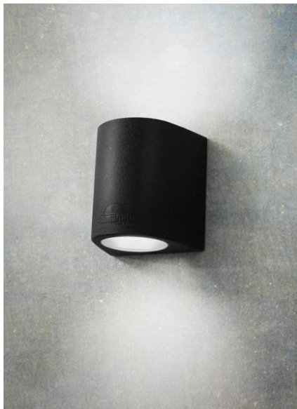
IL 101011 2A6.000.C2L 2x7W