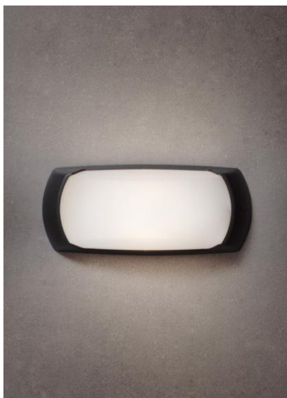
101013 2A1.000.F1L 6W