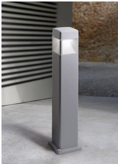
IL 101004 DS2.564.C1L 7W