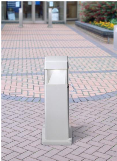
IL 101005 DS2.563.C1L 7W