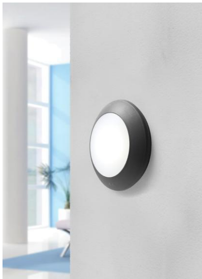
101014 1B1.000.G1L 3W