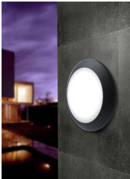
101016 1B2.000.PS7 E27 with sensor